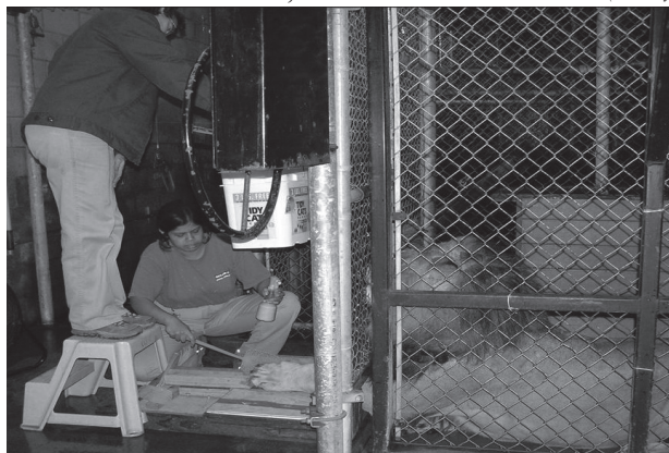
A lion is trained for radiographs of the front feet using a cat litter box as a prop for desensitizing the animal to the visual presence of the machine.