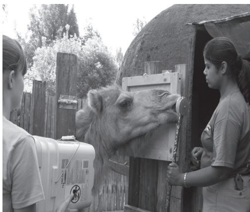
A camel is trained for radiographs using a reflector as a target.