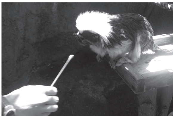
A cotton swab is used as a target for a cotton top tamarin.