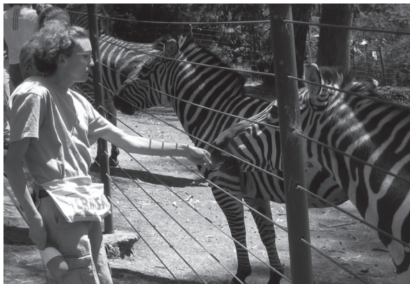
A keeper trains a zebra using the tool apron pouch.

Fanny packs (upper left in 1 st photo), tool belts, or two-pocket waist tool aprons (left) also make great training pouches. These are frequently donated to our zoo. No donations? Try the hardware store, tool aprons can be found for less than $2. If you are using moist food as reinforcement items, it is easy to find inexpensive plastic containers, or reuse yogurt containers that slide into the pockets. All of these types of training pouches hold up well to washing and drying over many times. Each training pouch can be tied around or clipped to the trainer, leaving hands free.