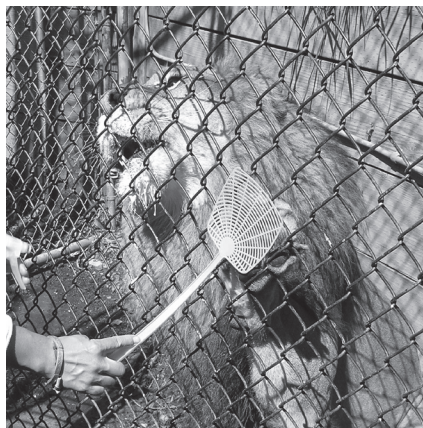
A lion is trained using a flyswatter as a foot target.